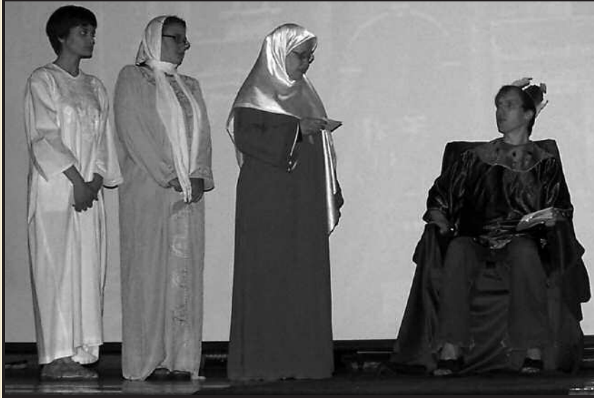
A scene from Dulcitius (A Dramatic Tale of Haughtiness Undone and Perseverant Innocence)